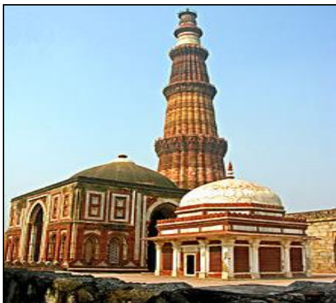
Fig 1: Origin of Delhi Sultanate

Muhammad Ghori died in 1206AD. He had no son. His commander, Qutbuddin Aibek, therefore, became master of his Indian Empire. He was the slave of Muhammad Ghori. Dynasty founded by him was, therefore, called 'Slave Dynasty'. All the Sultans after Aibek made Delhi as the capital of their kingdom. It was, therefore, named as Delhi Sultanat and its rulers were called as Sultans of Delhi. The period from 1206 to 1526 AD in the Indian History is called the Age of Sultans. During this period, five dynasties ruled: