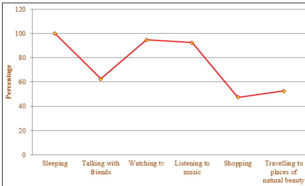
Fig 2: Graphics analysis of Different stress management activities as responded by the teachers

From table -2 and its graphical representation it has been seen that all the selected female teachers used to sleep for getting relieve from the occupational stress, 95.00% of female teachers watch tv, 92.50% listen to music as stress management activities, 62.50% talk with friends, 52.50% of them take travelling as stress management activities and 47.50% do shopping.