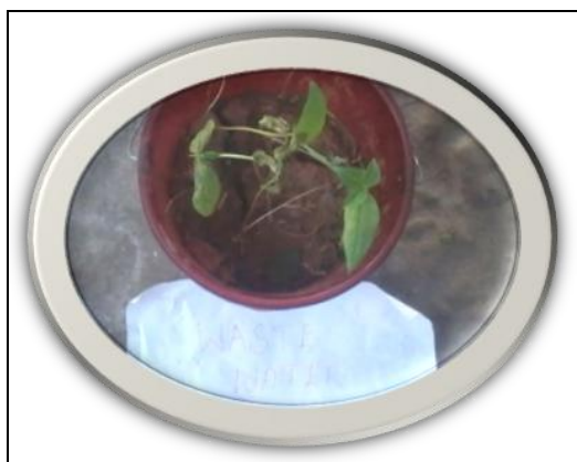
Fig 5: The growth of Plant in sugarmill effluent at 20 th day