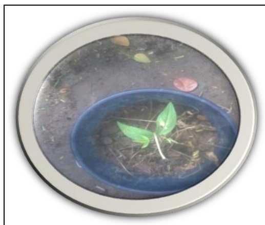
Fig 7: The growth of Plant in Sugar milleffluent at 30 th day