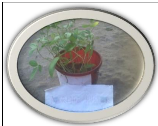
Fig 6: The growth of Plant in Normal water at 30 th day