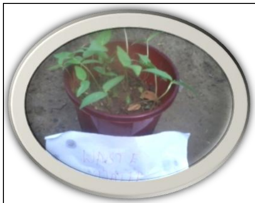
Fig 3: The growth of Plant in sugar mill effluent at 10 th day