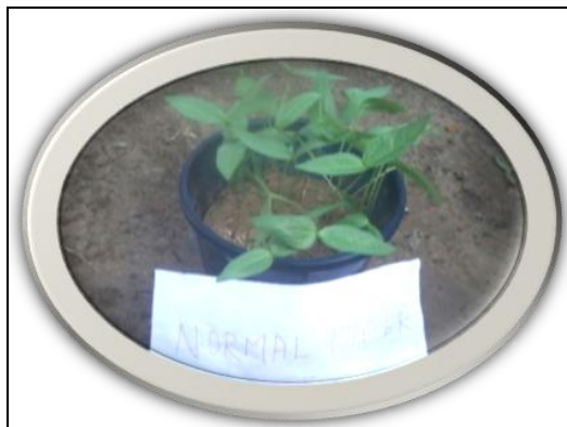
Fig 2: The growth of Plant in normal water at 10 th day