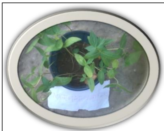
Fig 4: The growth of Plan in Normal water at 20th day